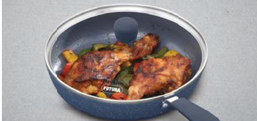
CERAMIC NONSTICK FRYING PAN