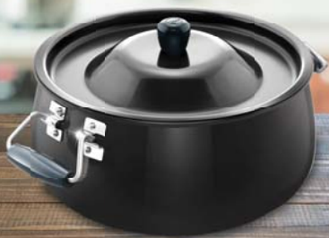
BIGBOY BIRYANI HANDI