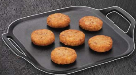
CAST IRON SQUARE TAVA