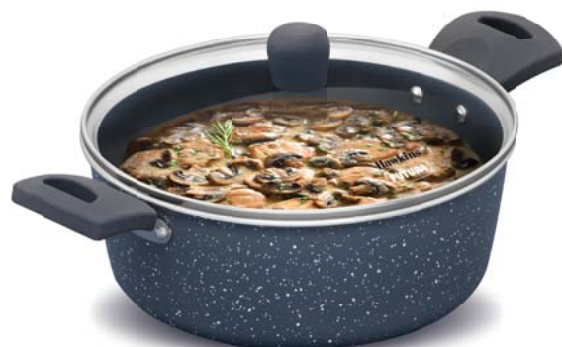
COOK n SERVE BOWL