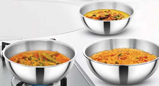
METRO KADHAI (TASLA)