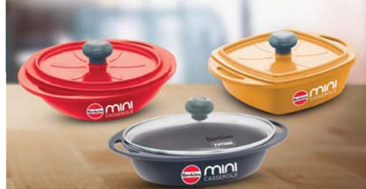
DIE-CAST MINI CASSEROLE